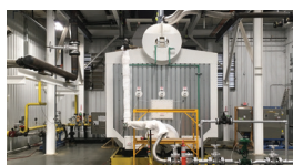
Steam Test Facility